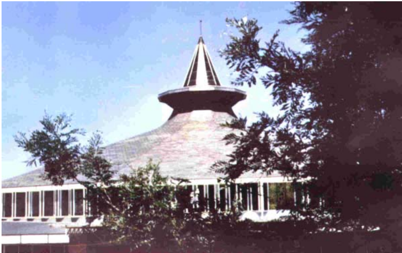
JATNIËL: LATTER RAIN MISSION OF SA TEMPLE AT BENONI

ent way as we see in Micah 7:19, "...thou wilt cast all their sins into the depths of the sea" and Jeremiah 31:34: "...I will forgive their iniquity, and I will remember their sin no more." After all, this is exactly why the Son of God became a Man—to pay for all of our sin, past, present and future—in Him (Jesus Christ) we are justified before God. That is why the Roman system of confession before a priest—and we have the same in this group—is wrong and unbiblical! It becomes a never ending circle of confession upon confession—what assurance can man give? Let the Roman doctrine as published in the Council of Trent serve as a warning: "If anyone says that after reception of the grace of justification the guilt is so remitted and the debt of eternal punishment so blotted out to every repentant sinner, that no debt of temporal punishment remains to be discharged either in this world or in Purgatory before the gates of Heaven can be opened, let him be anathema." (Canon 30) God knows the heart of man (Matthew 12:25), that is why He says to those who think they are righteous, "I will reveal your righteousness and your works, and they will not benefit you." (Is 56:12, Green's Literal Translation )