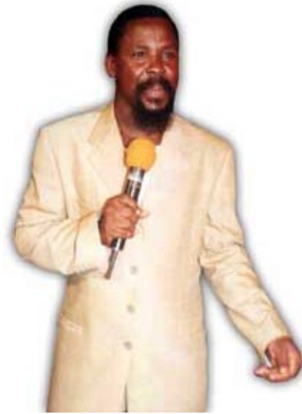
Photo from his site: